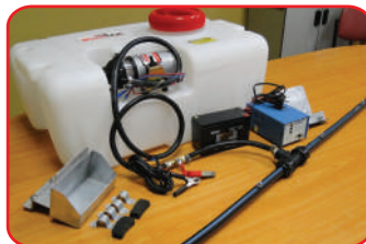
Water Spray (Optional)