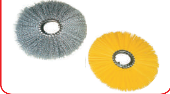
Poly and Wire Brush