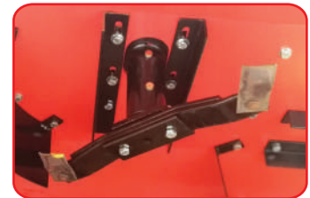
Blades with deflector guard

A fast and efficient mower for fine turf areas, HOWARD's Rollermower has three cutting heads and six overlapping fast-rotating swing-back blades.