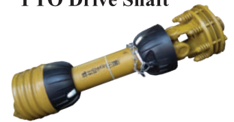
PTO Drive Shaft

This extra-heavy-duty rotavator performs excellently in demanding conditions and is ideal for “built-on” combinations - such as Ripper, Furrower or Crumble Roller.